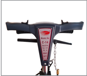
Simple to Use Operator Handle