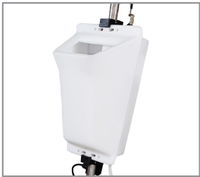
Large Solution Tank