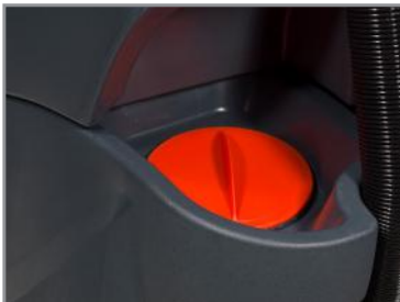
Easy Tank - Filling Access