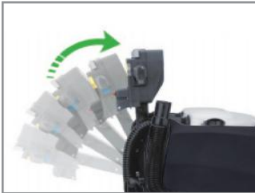
Folding / Adjustable Handle