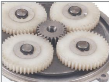
Planetary Gear Box