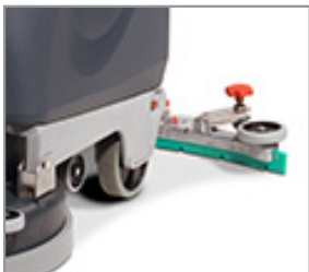
Wet Pick-Up Squeegee

Mains power and performance and plenty of both, the outstanding specification of the TT 4045 G is, without doubt, to the highest standard both in terms of design and equally in terms of performance.