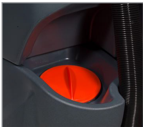
Easy Tank-Filling Access