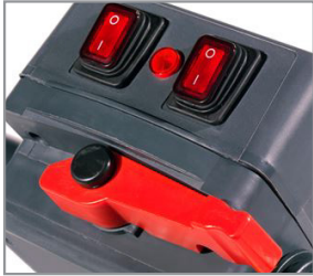
Simple to Use Operator Handle