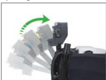
Folding / Adjustable Handle