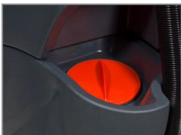
Easy Tank - Filling Access