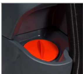
Easy Tank-Filling Access