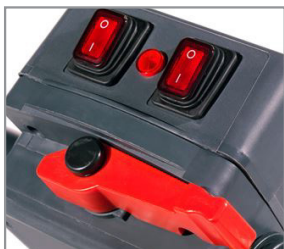
Simple to Use Operator Handle