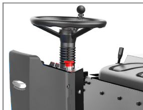
Simple to use Operator Steering