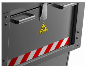
Unique Manual Hopper