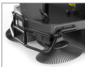
2 Side Brushes as Standard