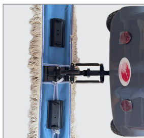
High Quality Cotton Mop