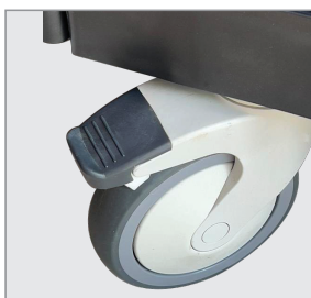
Castors with Brakes

A thorough cleaning program can require a lot of supplies, and the best way to transport those supplies to wherever they are needed is with the help of the Charnock Janitor Trolley. The CJT 4125 presents two compact trolley options, both with waste facilities, additional pails and onboard mopping systems.