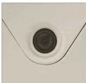
Intelligent Doll's Eye