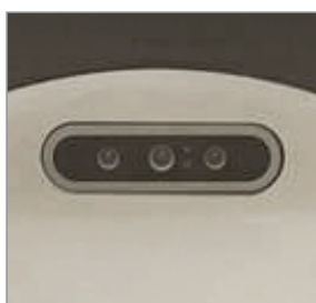
3D Ultrasonic Camera