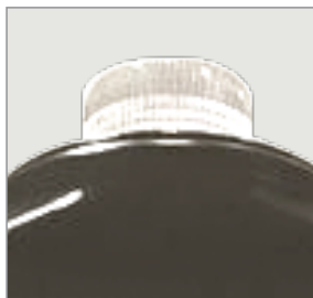
Blinker : Machine at Work