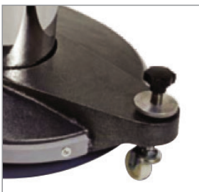
Height Adjustable wheel