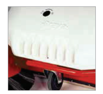
Front Castor Wheel for Easy Movement