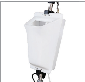
Large Solution Tank