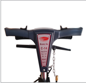
Simple To Use Operator Handle