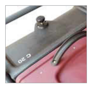
Brush Pressure Adjustment Knob

Ten times faster than manual sweeping, the Charnock walk behind mechanical sweeper sweeps more thoroughly than a broom, saving time and labour. Picks up dust, granules, paper, leaves even small screws; nails and bolts, just about anything keeping your surroundings neat and litter-free with minimal cost and effort. Use it indoors on floors outdoors on paths, roads, parking lots, petrol stations, anywhere. The brush pressure adjustment knob enables the optimum adaptation of the brushes to all floor conditions and types of dirt. The newly designed split-half brooms ensures easy replacement and cleaning of the brush and bristles.