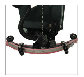
Wet Pick-Up Squeegy