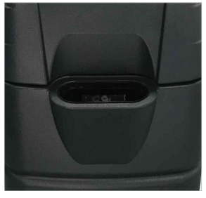
Easy Tank Filling Access