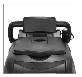
Simple to Use Operator Handle