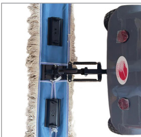
High Quality Cotton Mop