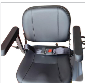
Seat Belt for Safety