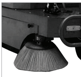
2 Side Brushes as Standard