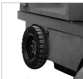
Strong Anti Slip Wheels