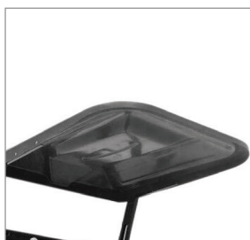
Roof Type Driver Cabin

The CRS 1814, is a high performance, low maintenance cost machine with remarkable sweeping effect. The vacuum cleaning system with a long filter element assists in picking up the dust efficiently. The machine has a master switch to control forward and backward movements. A small turning radius makes the equipment flexible and easy to operate. Wheeled hopper makes it convenient to empty the hopper. State of the art water sprinkler system on Side brushes to ensure best in class cleaning results.