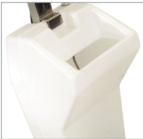
Large Solution Tank