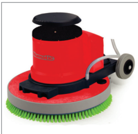
Optional Hi-Dust Filter