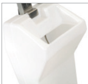
Large Solution Tank