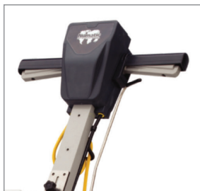
Simple To Use Operator Handle