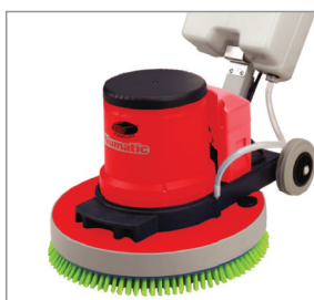
Optional Hi-Dust Filter