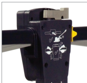
Simple To Use Operator Handle