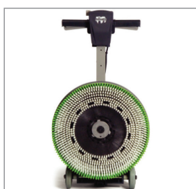
Extra Large Brush