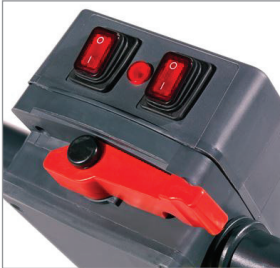
Simple to Use Operator Handle