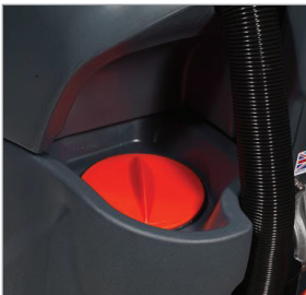
Easy Tank-Filling Access