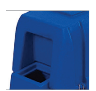
Fresh Water Tank