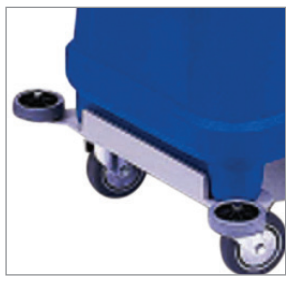
Non Marking Castors

Elite-Silent is a self-contained extractor for carpet and hard floor with manual traction. It washes, brushes and dries a stripe of 50 cm of carpet, moving forward, cleaning up to 500 sq. meters in one hour. It's 3 stage high-waterlift vacuum system allows to recover the maximum quantity of dirt from carpet and to get a shortest drying time.