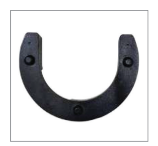
10kg Weight Optional