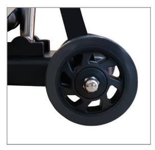
120 mm Wheel