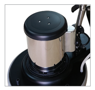
2.5 H.P Motor