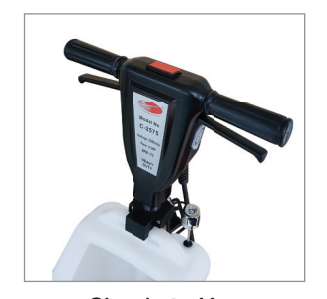
Simple to Use Operator Handle