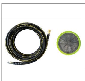
10 Meter Hose