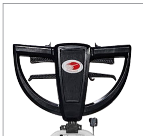
Simple to use Operator Handle