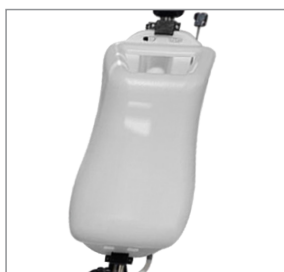
Large Solution Tank