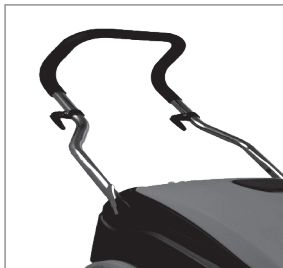
Height Adjustment Handle

CWV 6635 is Charnock's dedicated wide area carpet vacuum cleaner with contra rotating brushes.